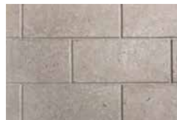
White Stacked Refractory Liner