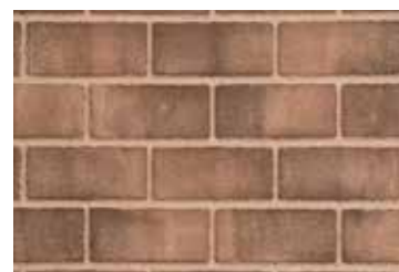
Back Bay Brown Fiber Liner