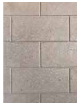
White Stacked Refractory Liners