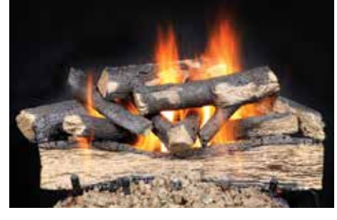
Fireside Versawood (split log shown)